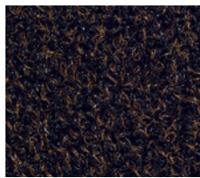
Brown 014 NCS: 8502R