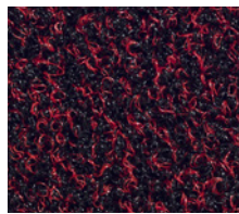
Red 016 NCS: 3560R