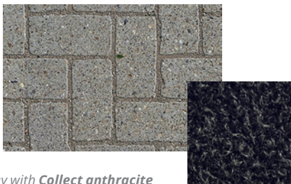
Pavement medium gray with Collect anthracite

Our designers develop colourways that complement every interior style. For ambiances ranging from classic to modern design. The broad Rinos range always has the right solution, to complement both interior design and floor type. Make your own combination on our website and be inspired by our options.