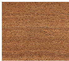
Naturel K19 NCS: 3040Y20R