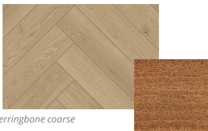
Wood light oak floor herringbone coarse with Duratap naturel

Our designers develop colourways that complement every interior style. For ambiances ranging from classic to modern design. The broad Rinos range always has the right solution, to complement both interior design and floor type. Make your own combination on our website and be inspired by our options.