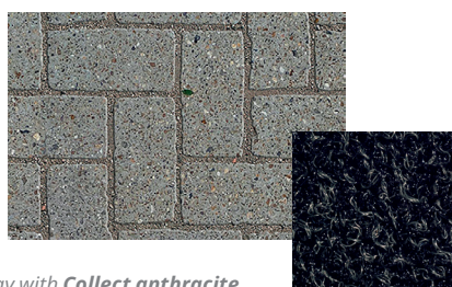
Pavement medium gray with Collect anthracite

Our designers develop colourways that complement every interior style. For ambiances ranging from classic to modern design. The broad Rinos range always has the right solution, to complement both interior design and floor type. Make your own combination on our website and be inspired by our options.