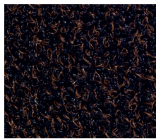
Brown 014 NCS: 8502R